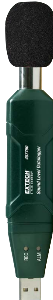
USB connector plugs into PC for quick downloading of Sound Level data to be analyzed using the software included