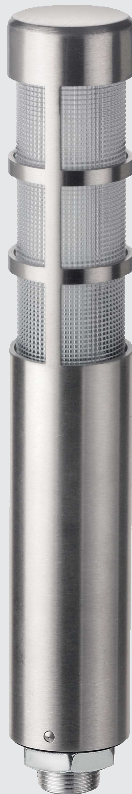
Size comparison deSIGN 42 / KombiSIGN 72