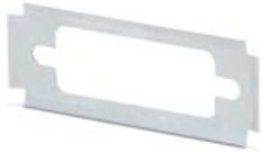
D-SUB EMC shroud, shell size 2, shielded, for panel mounting frame VS-15...

Please be informed that the data shown in this PDF Document is generated from our Online Catalog. Please find the complete data in the user's documentation. Our General Terms of Use for Downloads are valid ( http://phoenixcontact.com/download )