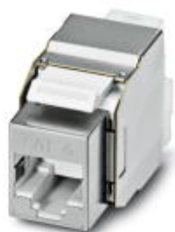
RJ45 socket insert, modular (Keystone), CAT6, 8-pos., shielded, with cable connection (LSA), for litz and solid wires AWG 26 ... 22

Please be informed that the data shown in this PDF Document is generated from our Online Catalog. Please find the complete data in the user's documentation. Our General Terms of Use for Downloads are valid ( http://phoenixcontact.com/download )