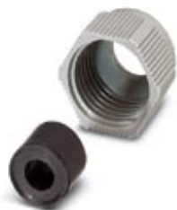
D-SUB cap nut with line seal, for conductor diameter of 3 mm ... 7 mm, for sleeve housing VS-15-...

Please be informed that the data shown in this PDF Document is generated from our Online Catalog. Please find the complete data in the user's documentation. Our General Terms of Use for Downloads are valid ( http://phoenixcontact.com/download )