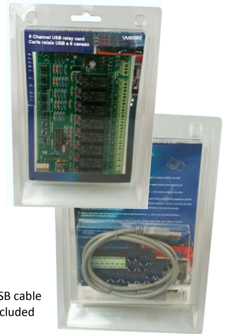
USB cable included