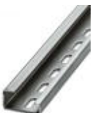
G-profile DIN rail, material: Steel, perforated, height 15 mm, width 32 mm, length 2 m

DIN rail perforated - NS 32 PERF 2000MM - 1201002