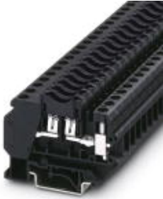
Flat-type fuse terminal block, cross section: 0.2 - 6 mm 2 , AWG: 26 - 8, width: 8.2 mm, color: black

Please be informed that the data shown in this PDF Document is generated from our Online Catalog. Please find the complete data in the user's documentation. Our General Terms of Use for Downloads are valid ( http://phoenixcontact.com/download )