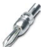
Test plugs, Color: silver