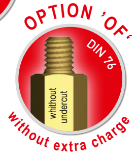
(Illustration: Brass blank, optional bl.)

Minimum tensile strength: 430 N/mm 2 Tolerance for length dimensions: +/- 0,1 mm