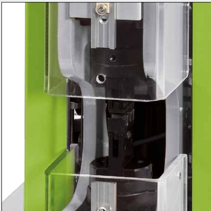
Model CM 25-1 – crimping machine for universal use with guards