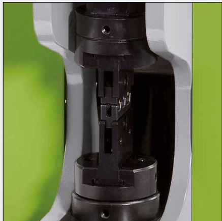
Model CM 25-6 – crimping machine with reduced stroke, without guards