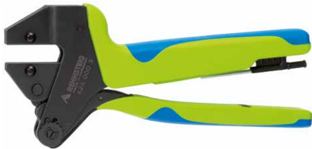
Art. No. 624 000 3