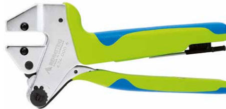
Art. No. 624 000 6