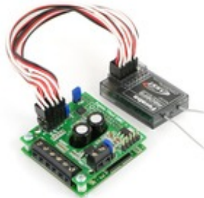
Pololu TReX connected to an RC receiver

Note: The TReX does not require use of the serial interface to function; it will work right out of the box as an electronic speed control (ESC). You will not have access to the full suite of features the TReX provides if you do not make use of the serial interface, though.