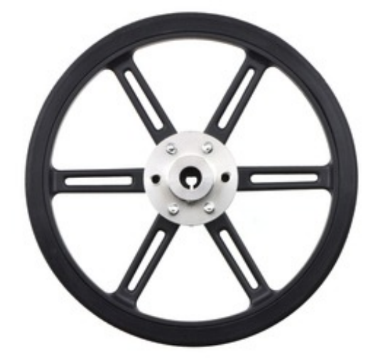
Pololu universal hub for 6mm shaft mounted to Pololu 90×10mm wheel.