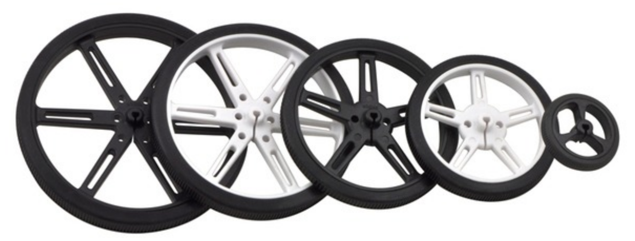
Pololu wheels with 90, 80, 70, 60, and 32mm diameters.