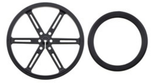
90×10mm wheel with tire removed.