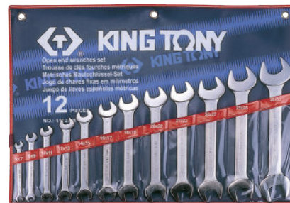
► MR / SR : Nylon pouch bag