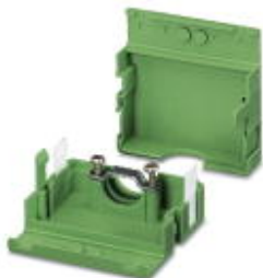
Cable housing, Pitch: 0 mm, Number of positions: 5, Dimension a: 25 mm, Color: green

Please be informed that the data shown in this PDF Document is generated from our Online Catalog. Please find the complete data in the user's documentation. Our General Terms of Use for Downloads are valid ( http://phoenixcontact.com/download )