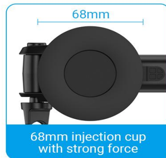
68mm injection cup with strong force