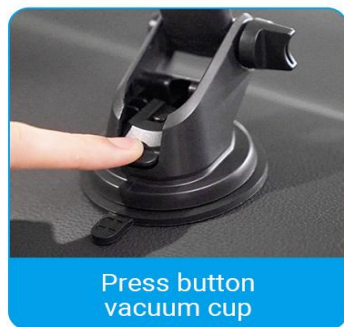
Press button vacuum cup