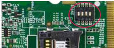
Figure 3. SW601 setting for internal boot mode