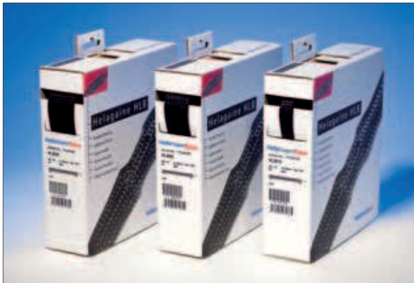
Helagaine HLB: The expansion rate makes it possible. Only three sizes in a handy dispenser box for almost all standard diameters.

To prevent fraying, the sleeve is cut with a hot-cutting tool, which melts and cleanly fuses the ends of the yarn