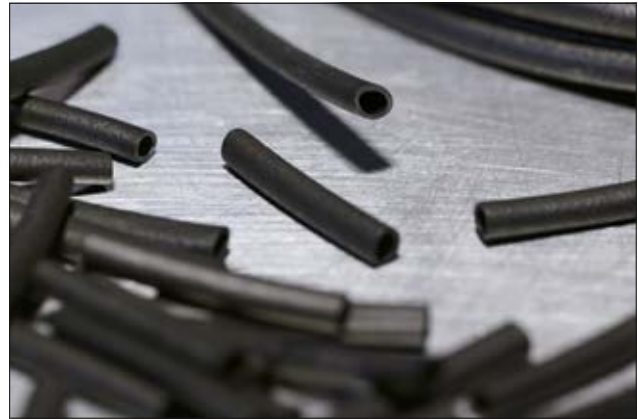
H rubber tubing is highly flexible and easy to apply.