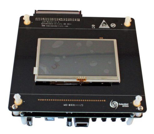
Figure 1 - LCD Board Mounting Options