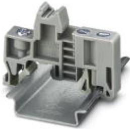
End clamp, Width: 9.5 mm, Height: 35.3 mm, Length: 50.5 mm, Color: gray

Please be informed that the data shown in this PDF Document is generated from our Online Catalog. Please find the complete data in the user's documentation. Our General Terms of Use for Downloads are valid ( http://phoenixcontact.com/download )