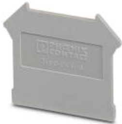
End cover, Length: 42.5 mm, Width: 1.8 mm, Height: 35.9 mm, Color: gray

Please be informed that the data shown in this PDF Document is generated from our Online Catalog. Please find the complete data in the user's documentation. Our General Terms of Use for Downloads are valid ( http://phoenixcontact.com/download )