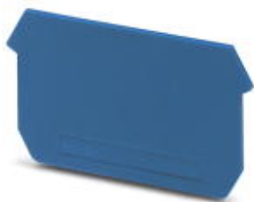
End cover, Length: 63.5 mm, Width: 1.5 mm, Color: blue

Please be informed that the data shown in this PDF Document is generated from our Online Catalog. Please find the complete data in the user's documentation. Our General Terms of Use for Downloads are valid ( http://phoenixcontact.com/download )