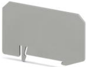
Partition plate, Length: 73.5 mm, Width: 2 mm, Height: 47.2 mm, Color: gray

Please be informed that the data shown in this PDF Document is generated from our Online Catalog. Please find the complete data in the user's documentation. Our General Terms of Use for Downloads are valid ( http://phoenixcontact.com/download )