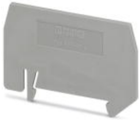
Partition plate, Length: 61 mm, Width: 2 mm, Height: 42 mm, Color: gray

Please be informed that the data shown in this PDF Document is generated from our Online Catalog. Please find the complete data in the user's documentation. Our General Terms of Use for Downloads are valid ( http://phoenixcontact.com/download )