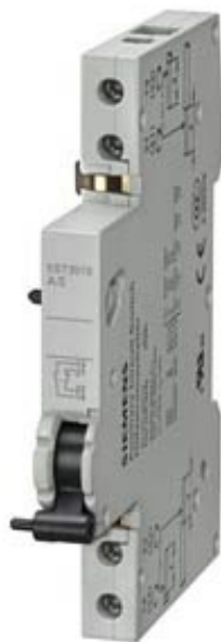
AUXILIARY SWITCH MOUNT. 1S+1OE, F. LS-SWITCH T=70MM