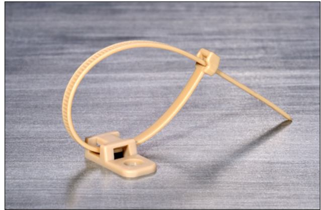
Peek Fixing solution PEEK containing of CTAM und PT2A.

Material specification please see page 30.